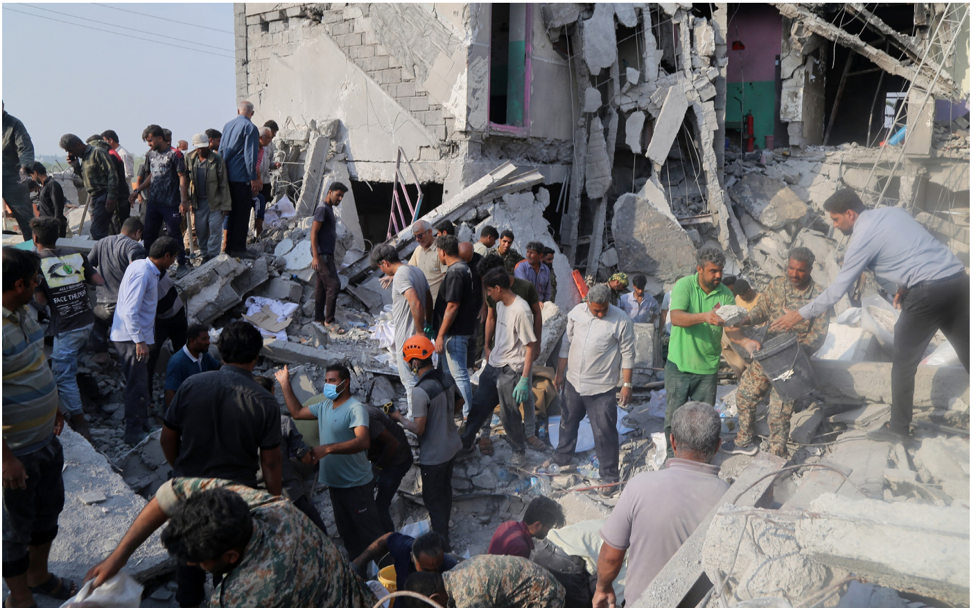
The US murdered over 175 people, mainly young girls, in a cruise missile attack on Shajareh Tayyebbeh school in Min-ab, Iran, on 28 February.

The ongoing war on Iran by US and Israel is unprovoked and a violation of international law. It is a continuation of the imperialistic policy of the US against the people of Iran.