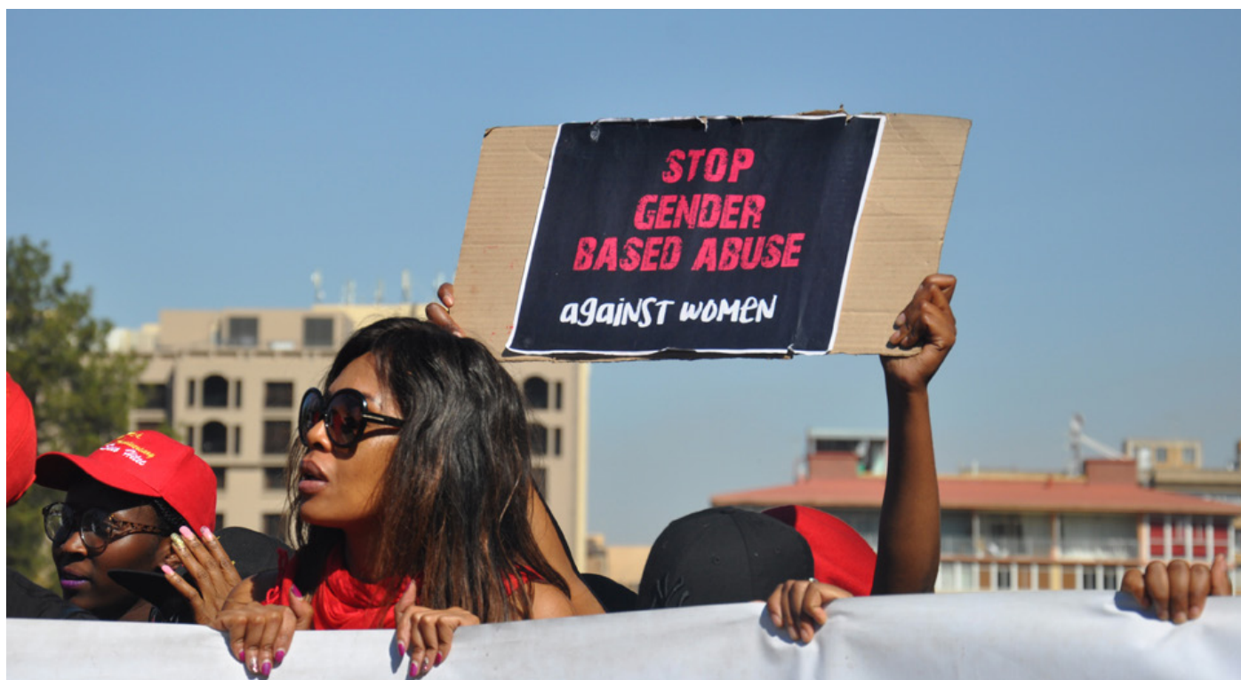
Protest against gender-based violence in Pretoria. Archive photo.

On 4 March 2026, Comrade Mosiuoa “Terror” Lekota died. On 7 March, the SACP stood outside the US consulate in Sandton to condemn the assassination of Iran’s supreme leader and the murder of 175 people, mainly school girls, by US bombs. On 8 March, working-class women gathered in Thembisile Hani, in Bloemfontein, in Soweto—not to celebrate, but to struggle. In Ganspan, the spinach cooperative harvested another month’s yield. In five provinces, 1,689 birds laid over a thousand eggs a day.