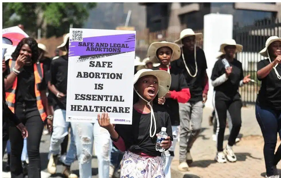
Reproductive rights include the right to contraception, abortion, fertility services, comprehensive sexual education and quality prenatal and maternal care. The right to reproductive healthcare is made explicit in the South African Constitution.

Powers that once claimed to uphold rules now disregard them, while the poorest, workers and especially women bear the heaviest burdens.