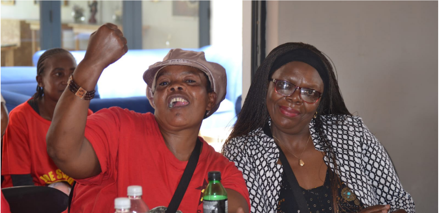
The proletarian women of South Africa are the backbone of society, and it is time to rise and claim their rightful place in the struggle for a socialist future.