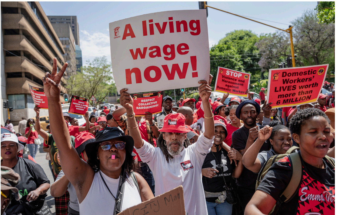
Municipalities must provide decent work opportunities and absorb atypical workers into direct state employment.