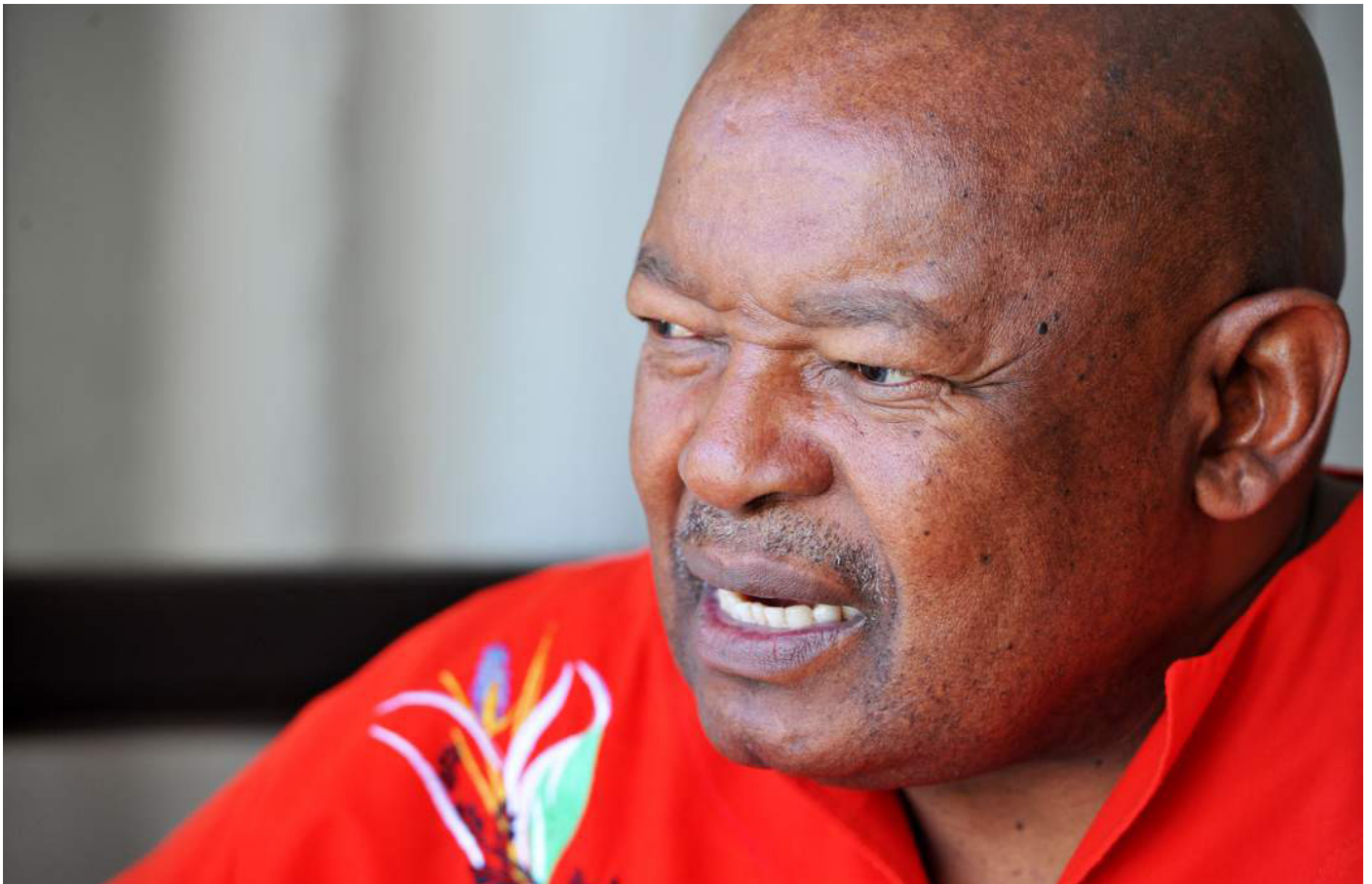
Mosiuoa Gerard Patrick "Terror" Lekota.